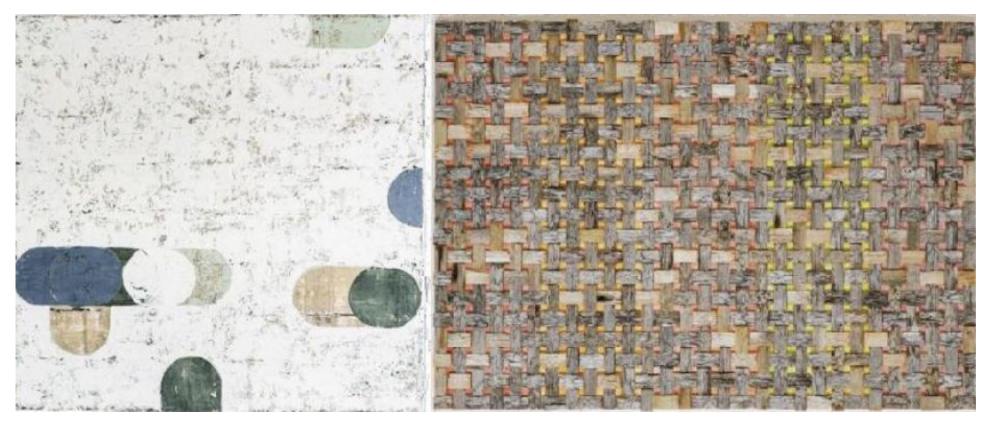
Linssen, WKZ-74212_DragAndDrop, 2019, Oil_canvas, 161x166 cml Naumanen, wo.T., 2019, roof shingle-plywood, 85x55 cm

Duration of exhibition: 31.10. - 30.11. 2019 Introduction: Margit Zuckriegl, (fine arts historian)