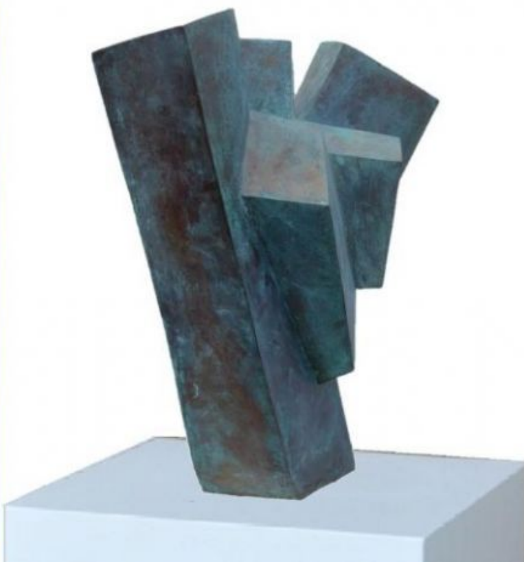
— Pillhofer: Sitting man, 1964, Indian ink, 42 x 49 cm | Archangel, 1968, bronze, 40 x 30 x 29 cm

Opening / Vernissage: Mi., 4. December 2019, at 19.00 o'clock